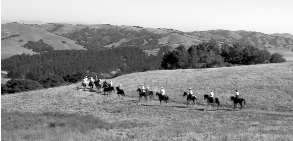
Horses Appreciate Hillsides in the East Bay Regional Parks District

415-383-6283 • FAX 415-381-3809 • e-mail babtt@earthlink.net • www.bayareabarnsandtrails.org