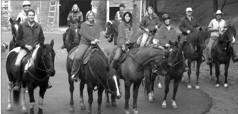
Equestrians at Marin Stables