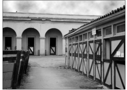
When will horses return to Golden Gate Park Stables?

-San Francisco Horsemen's Association www.sfhorsemen.org